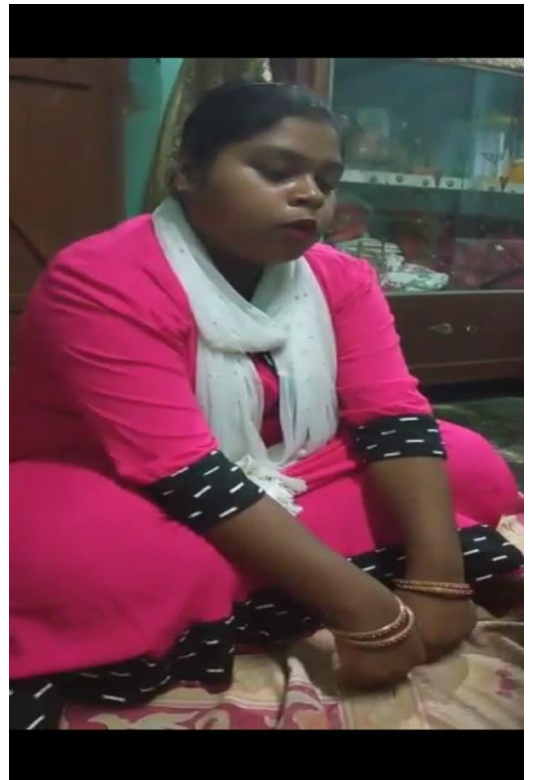
Figure 7- Folk song by girl having intellectual disability