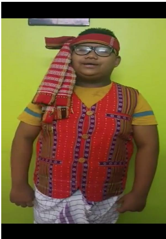
Figure 8- Folk song by a ADHD child