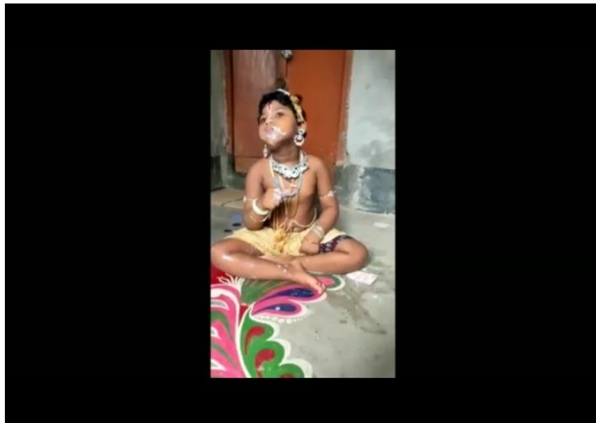
Figure 11- a child having cerebral palsy is in Sri Krishna dress