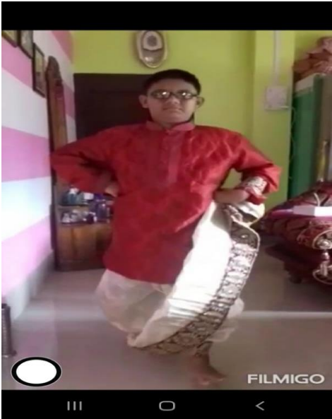
Figure 1-Fashion show by a special child