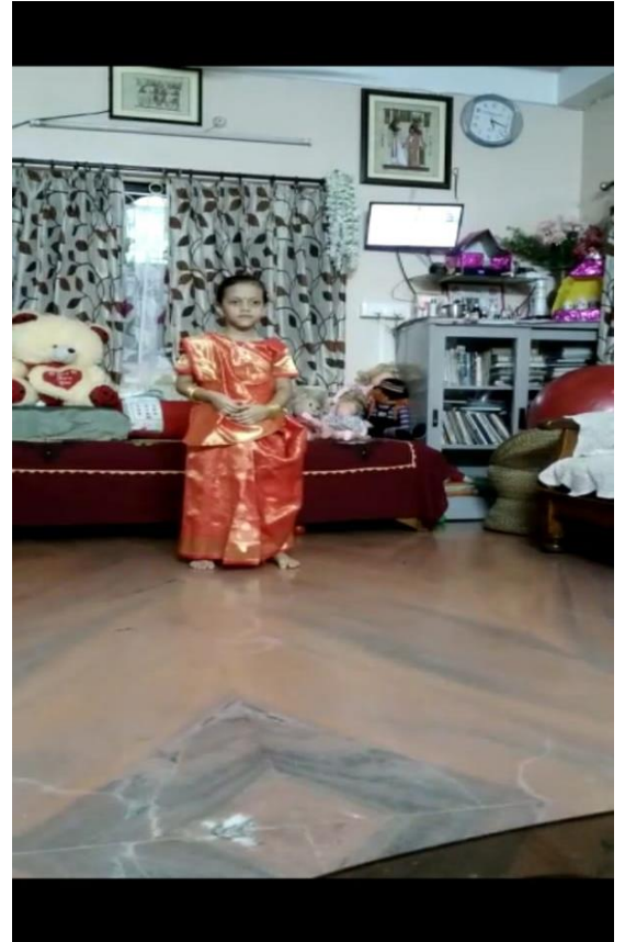
Figure 6- Folk dance by autistic girl