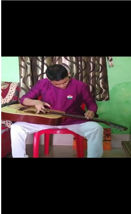
Figure 10-ADHD boy playing guitar