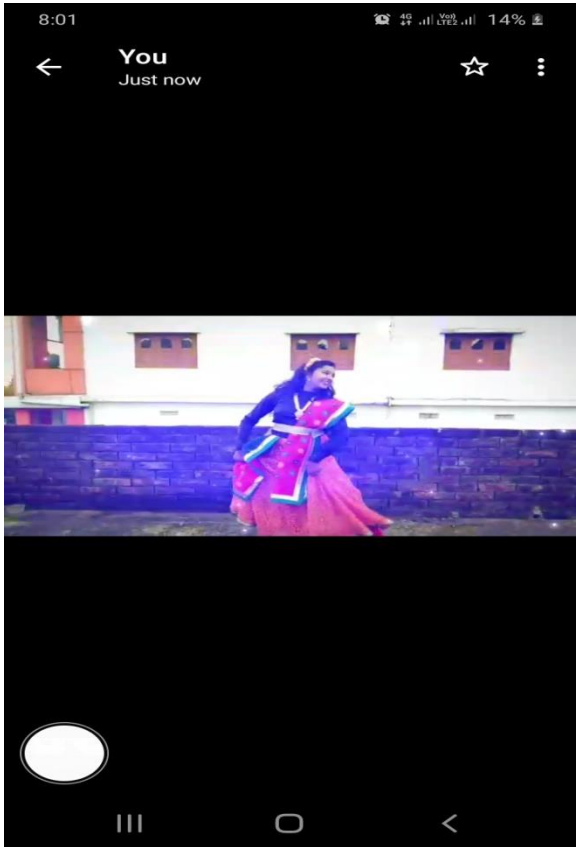
Figure 3- Folk dance by a girl having speech & language disability